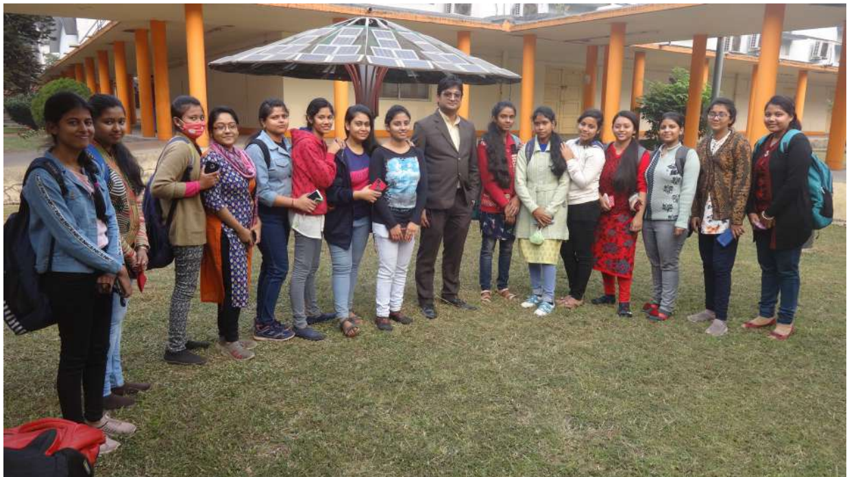
Fig. 06: Search for Microbiology.