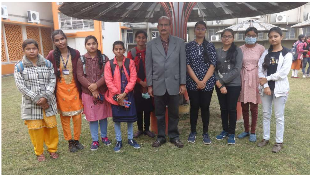
Fig. 07: Oh, it's Chemistry.