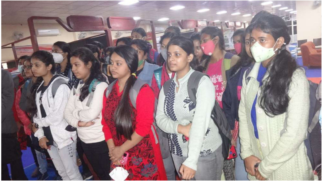
Fig. 09: The participants – on line, during demonstration.