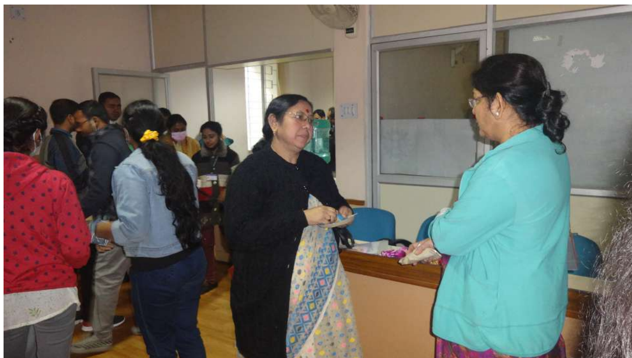
Fig. 04: The high tea and the knowledge culture.