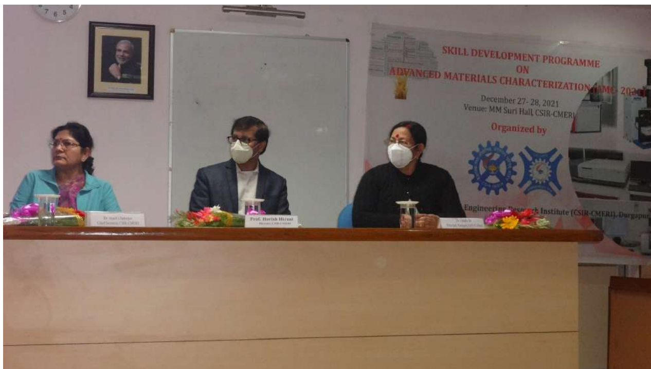
Fig. 03: The dignitaries in the inaugural session.