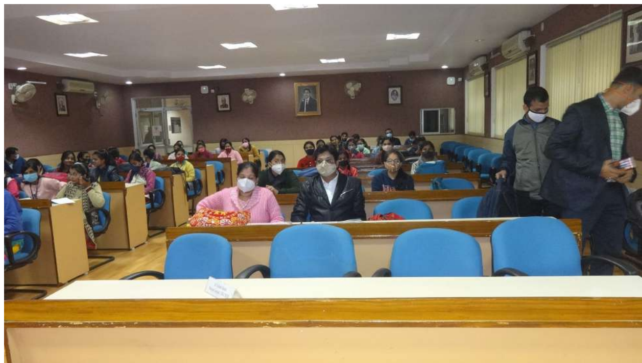
Fig. 02: The participants.