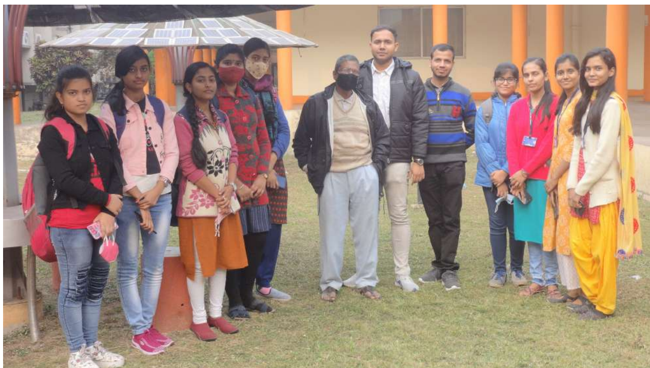
Fig. 08: Physics here.