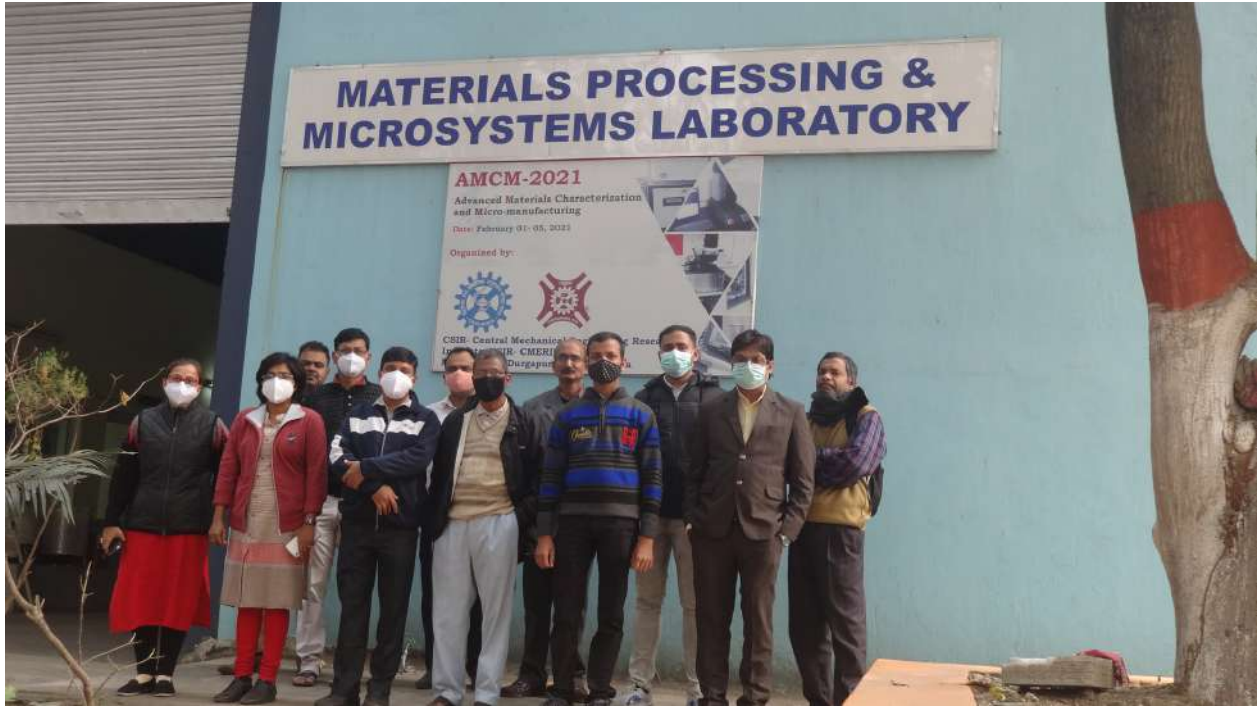
Fig. 05: The faculties and the resource persons.